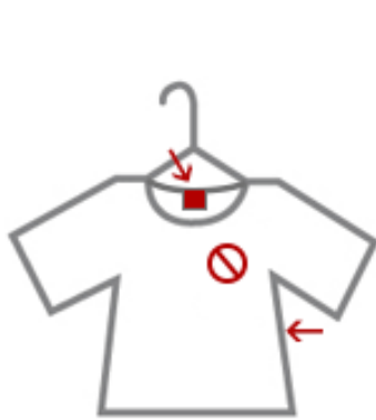
shirts & Dresses